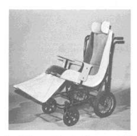
A special castered base is also custom made by Everest & Jennings Canadian to accommodate the fiberglass shell of the seat support system.