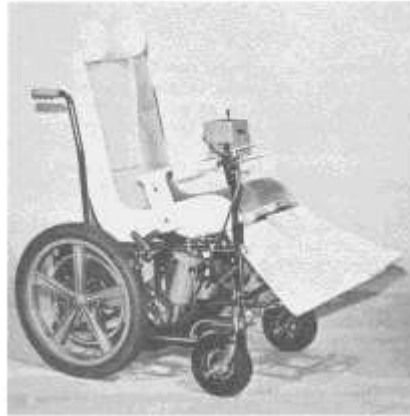
This special custom Everest & Jennings Canadian Model 3P Power Wheelchair Base will accommodate the fiberglass shell of the seat support system.