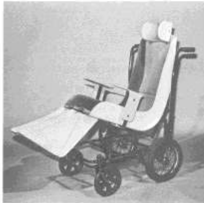
A special cambered base is also custom made by Everest & Jennings Canadian to accommodate the fiberglass shell of the seat support system.