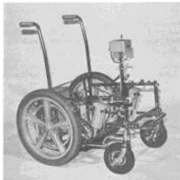
The power wheelchair base is a custom made Everest & Jennings Model 3F Power Wheelchair, modified to accommodate a fiberglass seat support. Provision is made to allow tilting of the seat from upright to 15 degrees of recline. The push handles are removable for storage of base in vehicles.