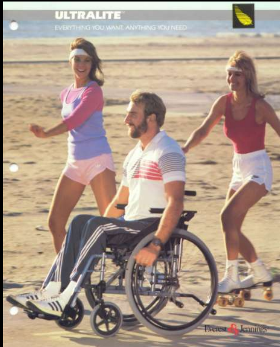
Ultralite – Circa 1987